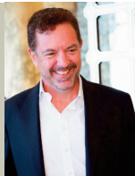
Rich Karlgaard Publisher, Forbes

1:00 – 3:00 pm | Golden Gate A-B (ticketed)